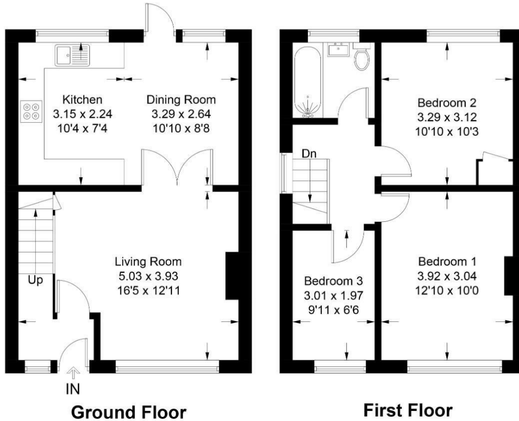
Illustration for identification purposes only, measurements are approximate, not to scale. Fourlabs.co © (ID1159625)

Approximate Gross Internal Area = 75.2 sq m / 809 sq ft